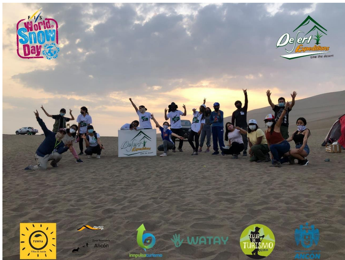
Figure 4. Desert Expeditions organizing team and invited organizations.

These strategic alliances will allow us to continue developing the following editions of the World Snow Day since we seek the same purpose: To encourage the participation of the population in sports and the care of the environment.